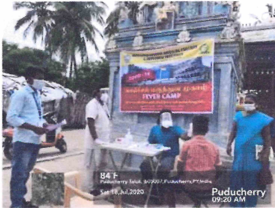
COVID 19 Screening camp by students of Mahatma Gandhi Medical College & Research Institute