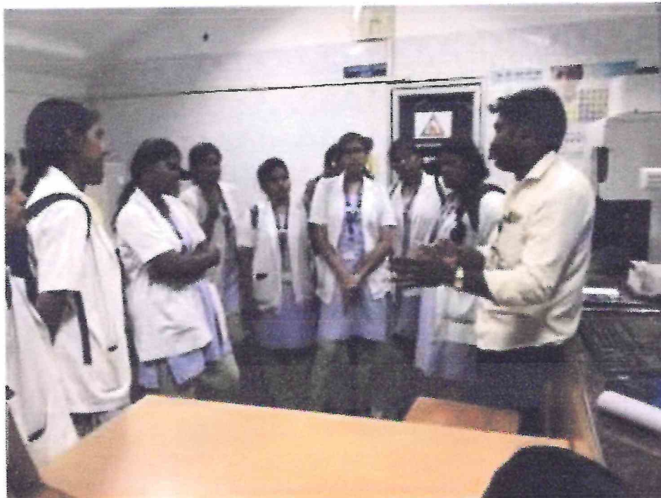
Portonovo visit by the Students of Indira Gandhi Institute of Dental Sciences

REGISTRAR SRI BALAJI VIDYAPEETH (Deemed University u/s 3 of UGC ACT, 1956) Accredited by NAAC with 'A' Grade NH 45-A, Pillaiyarkuppam, Pondicherry-607 403.