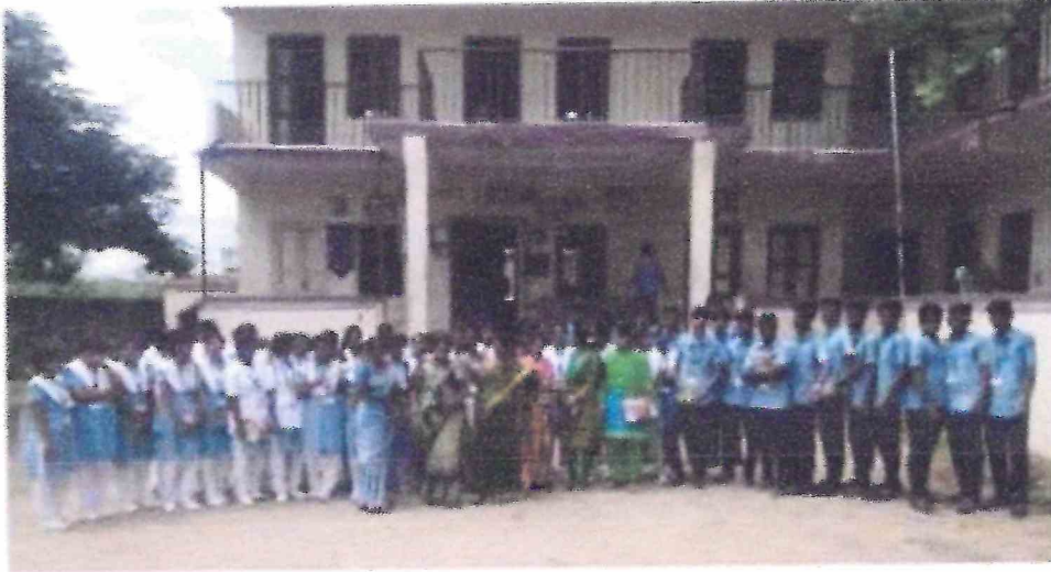
OASIS Special School visit by BSc Students

REGISTRAR SRI BALAJI VIDYAPEETH (Deemed University u/s 3 of UGC ACT, 1956) Accredited by NAAC with 'A' Grade NH 45-A, Pillaiyarkuppam, Pondicherry-607 403.