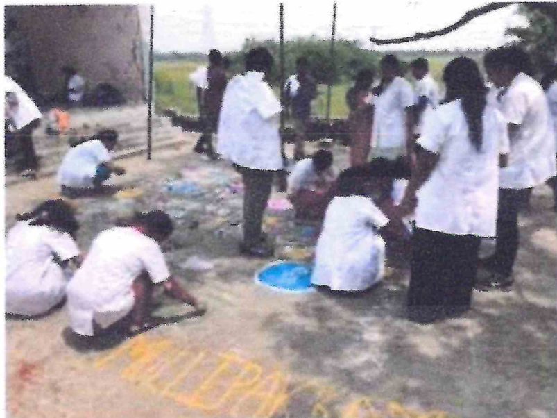
Field visit by the Students of Sri Sathya Sai Medical College & Research Institute

REGISTRAR SRI BALAJI VIDYAPEETH (Deemed University u/s 3 of UGC ACT, 1956) Accredited by NAAC with 'A' Grade NH 45-A, Pillaiyarkuppam, Pondicherry-607 403.