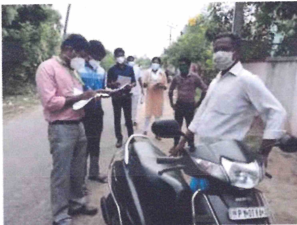
Field visit by students of Mahatma Gandhi Medical College & Research Institute