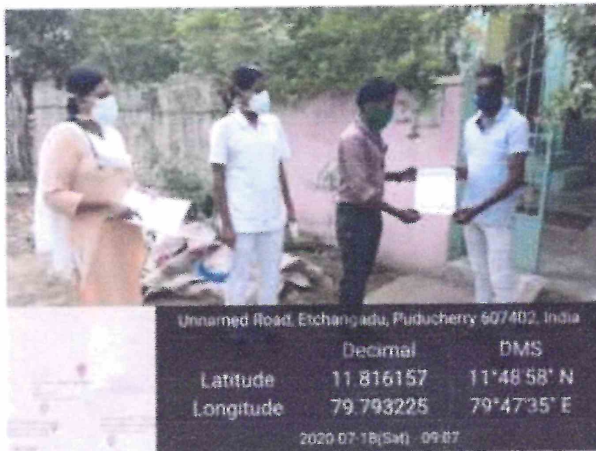
Field visit by students of Mahatma Gandhi Medical College & Research Institute

REGISTRAR SRI BALAJI VIDYAPEETH (Deemed University u/s 3 of UGC ACT, 1956) Accredited by NAAC with 'A' Grade NH 45-A, Pillaiyarkuppam, Pondicherry-607 403.