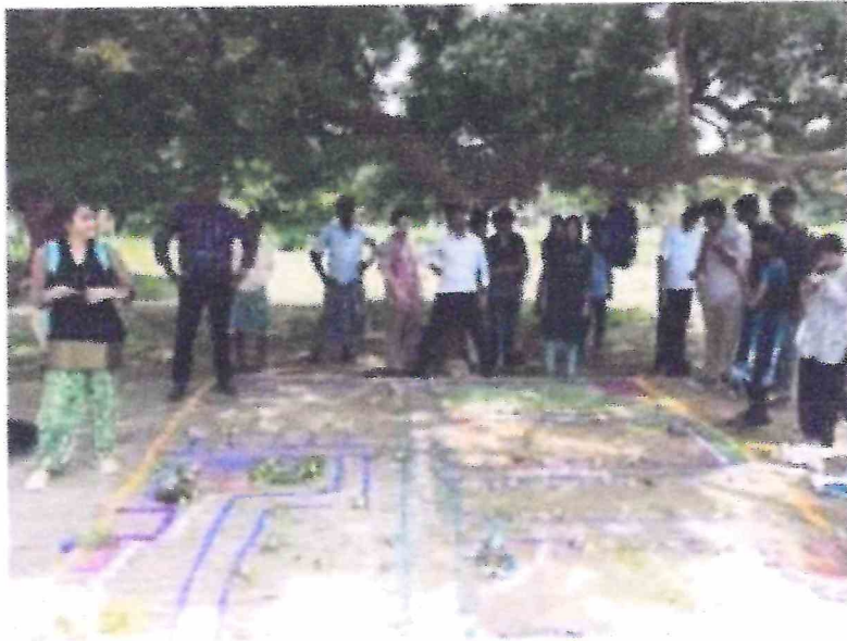
Field visit by the Students of Sri Sathya Sai Medical College & Research Institute

REGISTRAR SRI BALAJI VIDYAPEETH (Deemed University u/s 3 of UGC ACT, 1956) Accredited by NAAC with 'A' Grade NH 45-A, Pillaiyarkuppam, Pondicherry-607 403.