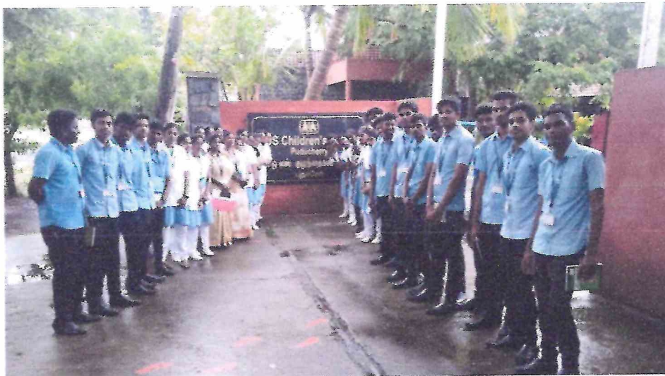
SOS Children's Village Visit by BSc Nursing students