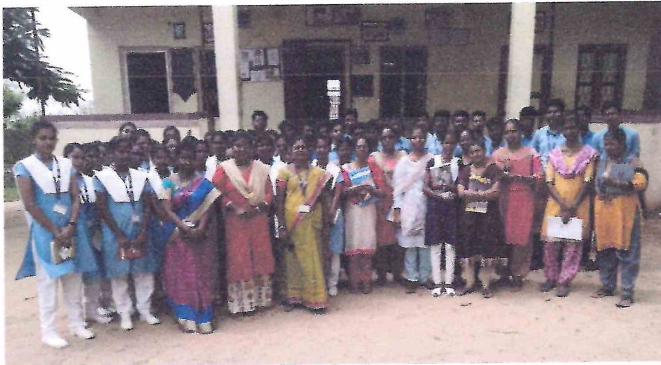
OASIS Special School visit by BSc Students