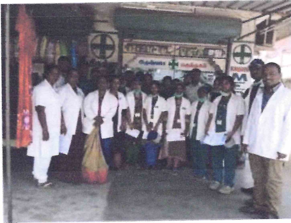
Field visit by the Students of Indira Gandhi Institute of Dental Sciences

REGISTRAR SRI BALAJI VIDYAPEETH (Deemed University u/s 3 of UGC ACT, 1956) Accredited by NAAC with 'A' Grade NH 45-A, Pillayarkuppam, Pondicherry-607 403.