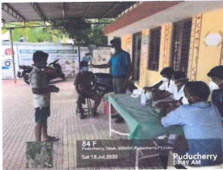
Visit to a PHC at Thavalakuppam by students of Mahatma Gandhi Medical College & Research Institute