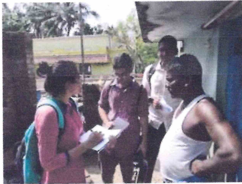
Field visit by the Students of Sri Sathya Sai Medical College & Research Institute