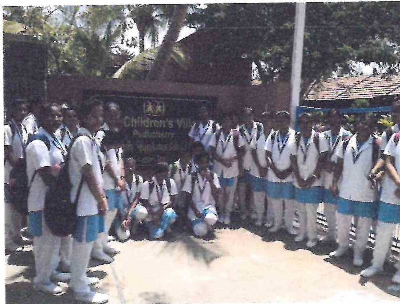
SOS Children's Village Visit by BSc Nursing students

REGISTRAR SRI BALAJI VIDYAPEETH (Deemed University u/s 3 of UGC ACT, 1956) Accredited by NAAC with 'A' Grade NH 45-A, Pillaiyarkuppam, Pondicherry-607 403.