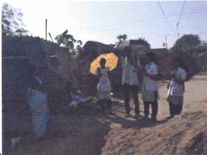
Field visit by the Students of Sri Sathya Sai Medical College & Research Institute