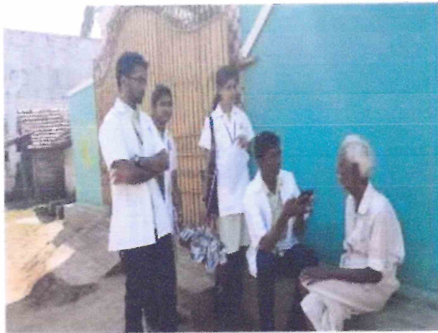
Field visit by the Students of Sri Sathya Sai Medical College & Research Institute

REGISTRAR SRI BALAJI VIDYAPEETH (Deemed University u/s 3 of UGC ACT, 1956) Accredited by NAAC with 'A' Grade NH 45-A, Pillaiyarkuppam, Pondicherry-607 403.