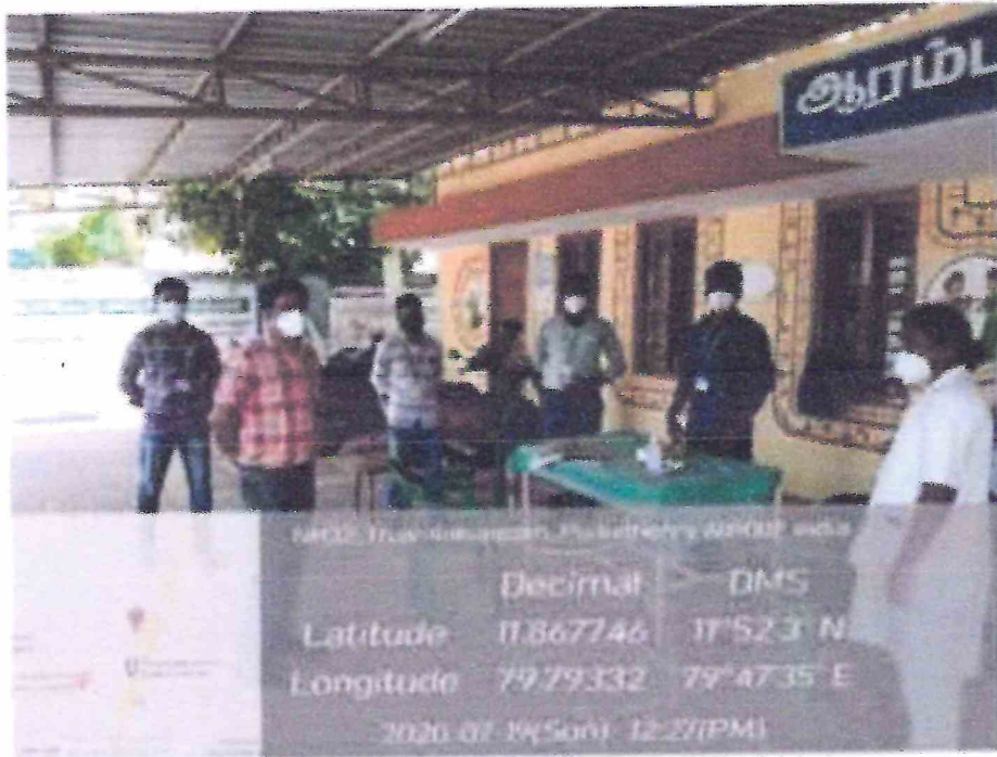
Visit to a PHC at Thavalakuppam by students of Mahatma Gandhi Medical College & Research Institute