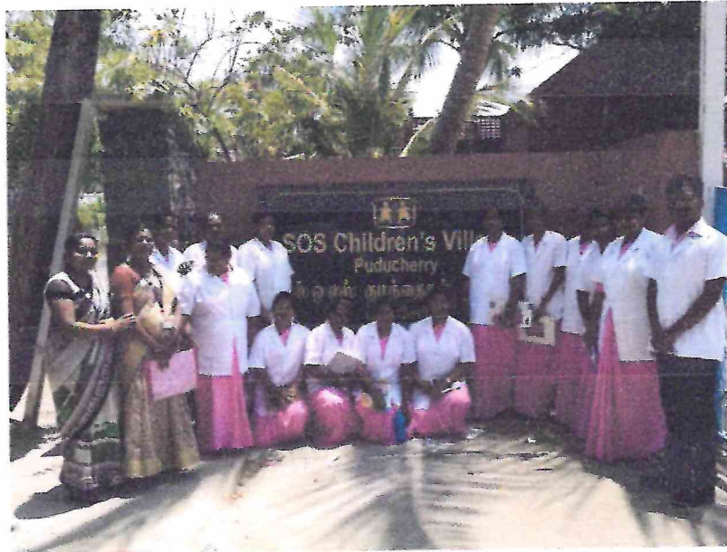
SOS Children's Village Visit by PBBS Nursing students