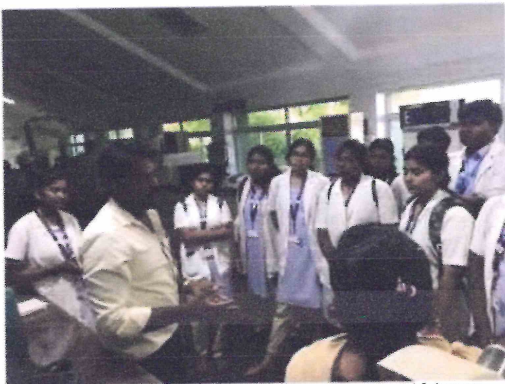
Portonovo visit by the Students of Indira Gandhi Institute of Dental Sciences

REGISTRAR SRI BALAJI VIDYAPEETH (Deemed University u/s 3 of UGC ACT, 1956) Accredited by NAAC with 'A' Grade NH 45-A, Pillaiyarkuppam, Pondicherry-607 403.