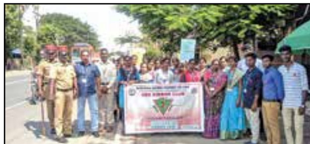
Christmas and New Year Celebration

Red Ribbon Club and National Service Scheme of KGNC had commemorated world AIDS day on 01.12.2018 based on the theme “Know your HIV Status” organized a Awareness Rally. Rally started at 10.30 am from Kirumampakkam Arch through Kirumampakkam to MGMCRI. B. Sc (N) final year students actively participated and created awareness to the public towards HIV/AIDS through creative slogans.