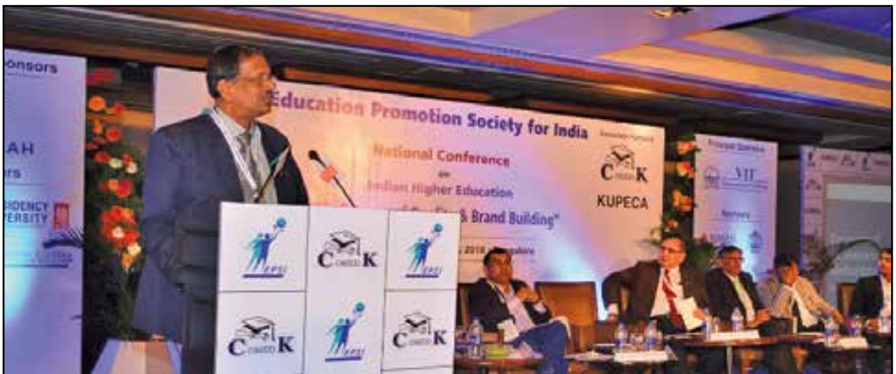
Speaker at National Conference on "Indian Higher Education: Challenges of Quality & Brand Building" Bangalore (24.11.2018)