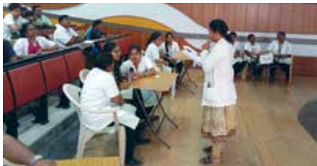
I MBBS Students Participated in the Symposium on Cranial Nerves conducted by the Dept. of Anatomy.

The Dept. of Physiology conducted Student Seminar for IMBBS on Glucose homeostasis on 20.4.18