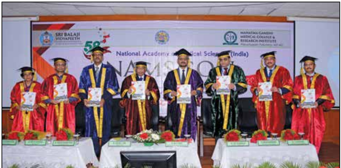
58th Annual Conference of the National Academy of Medical Sciences (India), 2018